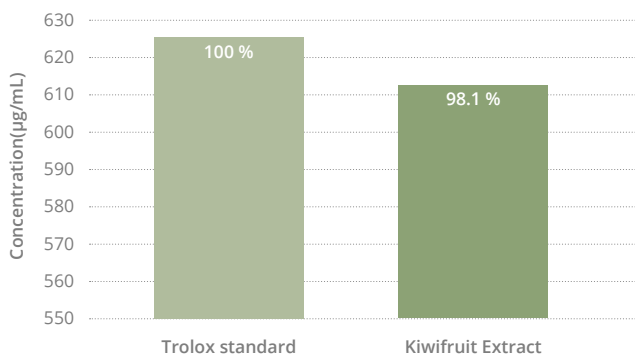
PlantæDerMX® Kiwifruit Extract